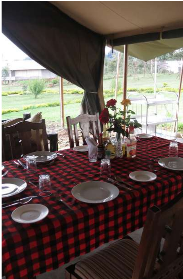
Renting Out the Conference Center