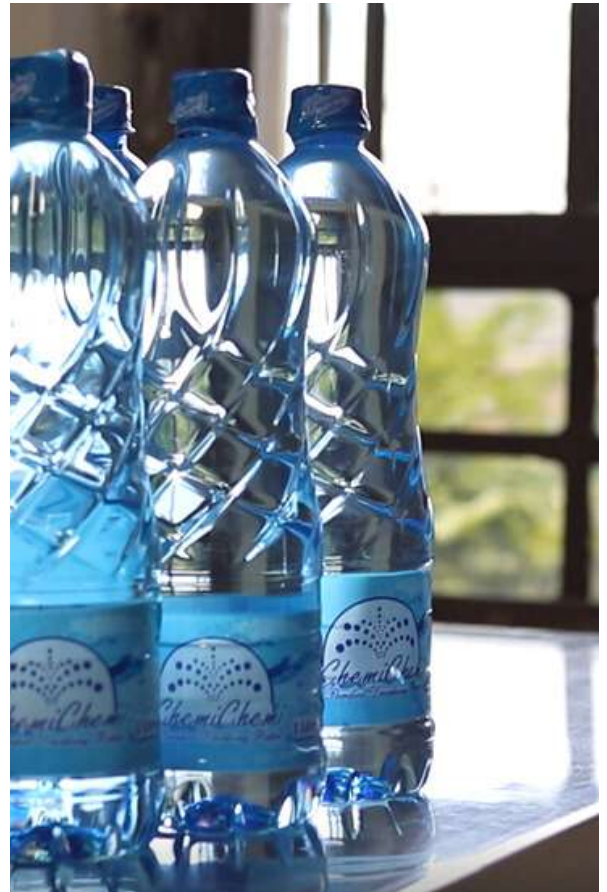
Growing the Water Bottling Business